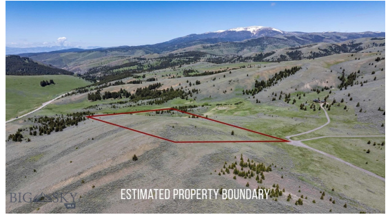
ESTIMATED PROPERTY BOUNDARY