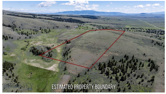
ESTIMATED PROPERTY BOUNDARY