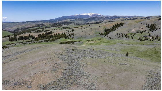
ESTIMATED PROPERTY BOUNDARY