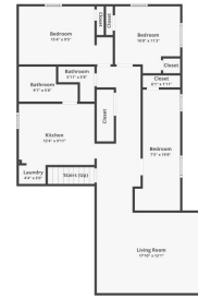
Basement BIG SKY