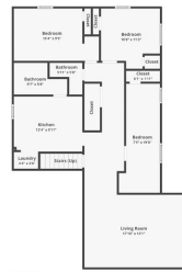
FLOOR 1 BIG SKY