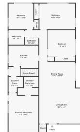
Floor 1 BIG SKY