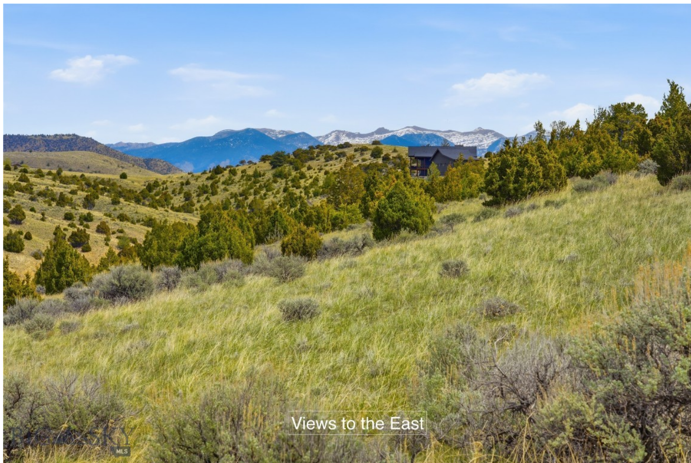
Views to the East

Powered by Data, Technology, and Local Expertise