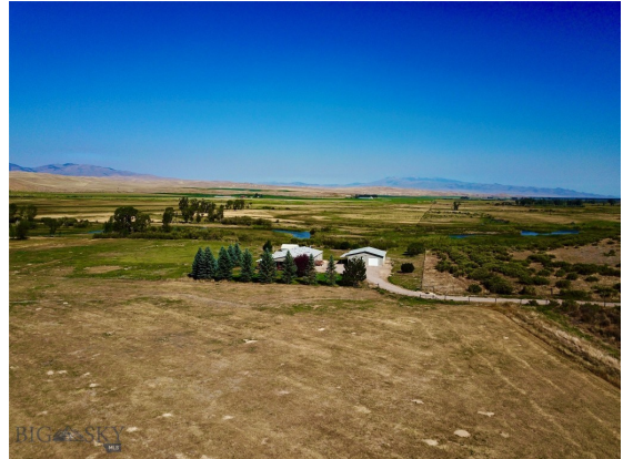
Wiebe #2 Musselshell County, Montana, 58.083 AC +/-