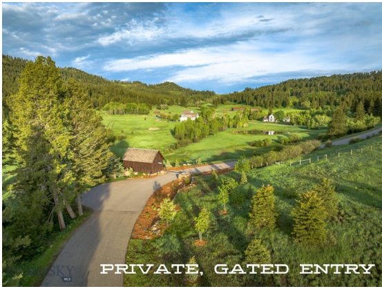
PRIVATE, GATED ENTRY